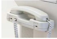
Handset Kit UE-403171