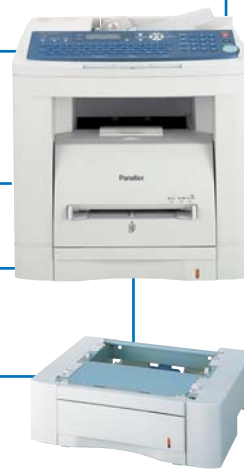
550-sheet 2nd Paper Feed Module DA-DS188