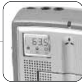
LCD Tape Counter displays recording time elapsed