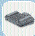
Foot Control 210

Included in the Analog Transcription Kit 710: