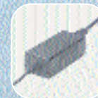
Power Supply 155