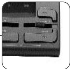
Fast access to any part of the tape with Turbo Wind