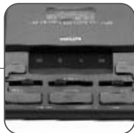
Optimum transcription playback quality from Volume, Tone and Speed Controls